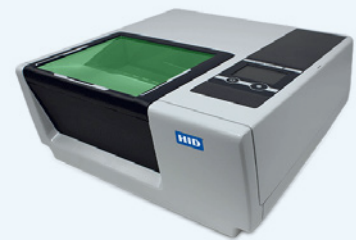
HID L Scan™ 1000