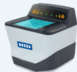
HID Guardian™ 200