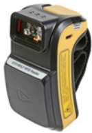
TSL 2173 / 1153 wearable RFID reader

HID Global is committed to the advancement of contactless automatic identification and data capture (AIDC) technologies. Our automated production lines and high-volume production capabilities are unmatched in the industry. With multiple ISO 9001:2015 and CC EAL 5+ certified manufacturing plants, we produce over 250 million units a year. Our R&D capabilities are second to none, and we work as a trusted advisor to end-users, developers, equipment suppliers, and system integrators to identify emerging needs and develop innovative solutions.