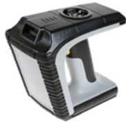
TSL 2166 rugged RAIN RFID reader