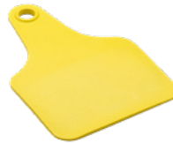
HID RAIN RFID Ear Tag